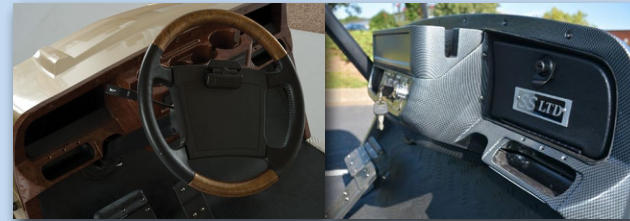
Wood grain or carbon fiber treatment