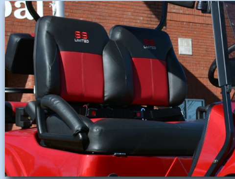
Plush two-tone seats