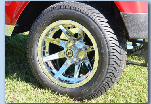
Dura Chrome Rims