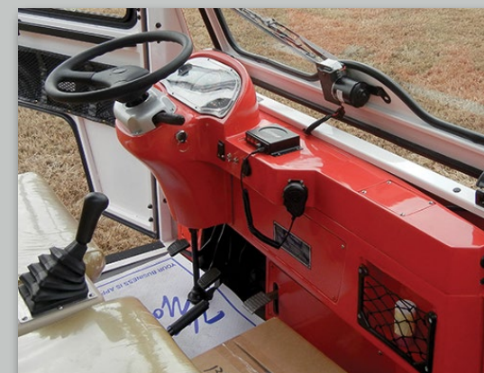
Fully accessorized with deluxe PA system, siren, LED lighting, and under-roof lighting