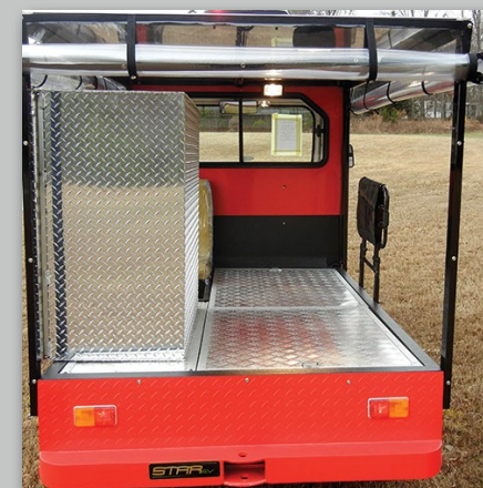
Ambulance bed and all-weather vinyl enclosure (rolled up)