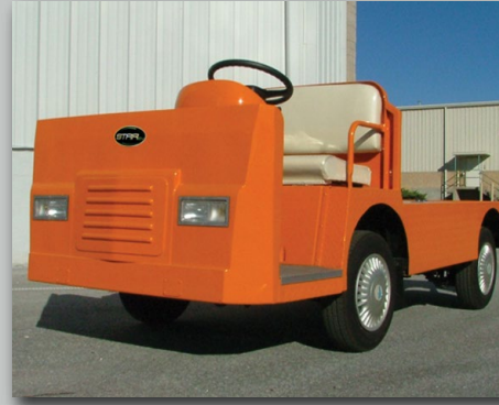
Flat bed, open cab option