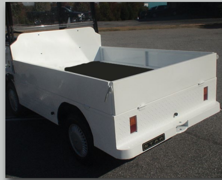
Standard heavy duty undercoating and bedliner