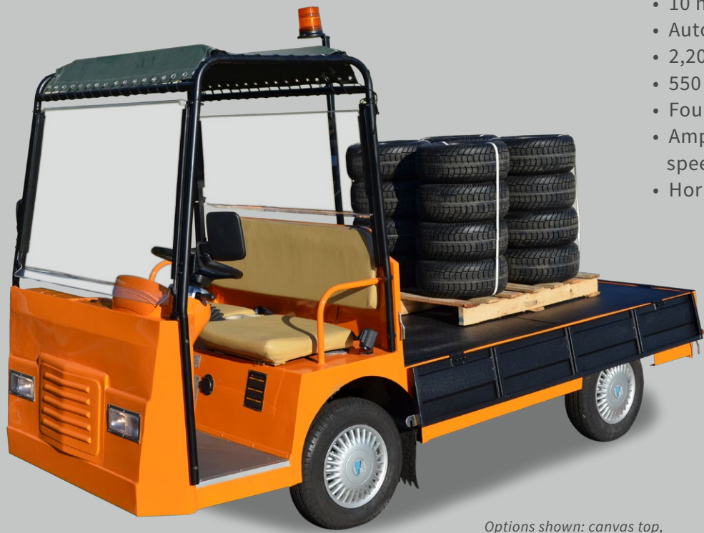
Options shown: canvas top, and amber strobe light

Our growing line of commercial-grade, electric vehicles gets the job done. From hauling to towing to recycling, we have the plug-in utility vehicles to meet all your industrial and commercial needs. When you've got a burden to carry, this is your truck. The U-Series is built to tow, haul, carry, and perform.