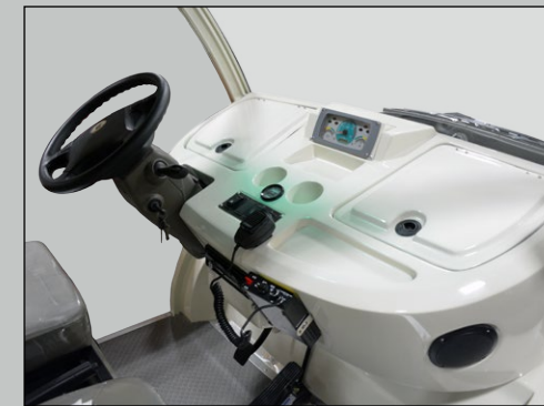
Front dash, roomy interior