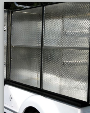
Deep aluminum shelving can be customized to your application