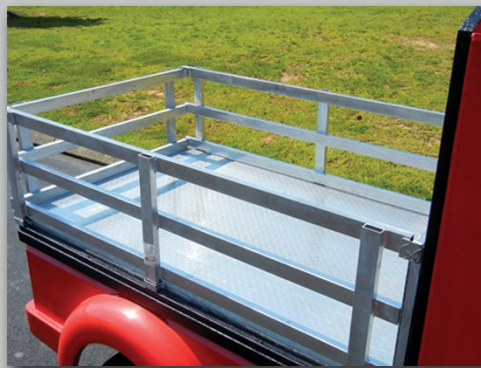
19" high stake backs to hold any equipment