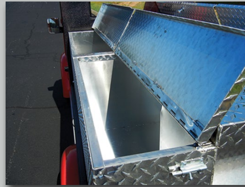
Large watertight ice/beverage compartments