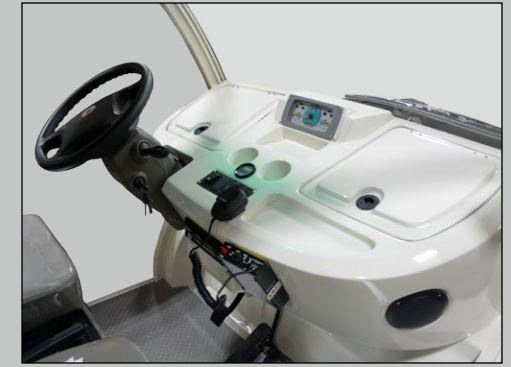
Front dash, roomy interior