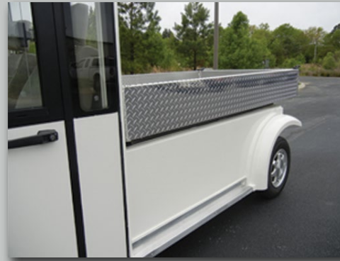
Fold-down tail gate; optional fold-down side rails