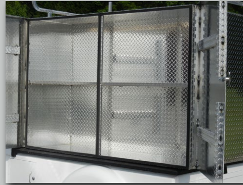
Locking, enclosed box with custom shelving