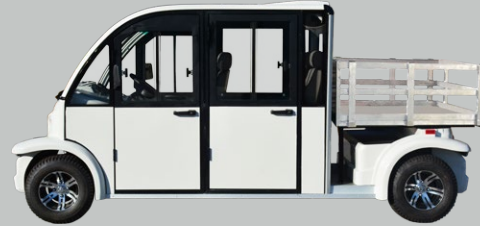
AK48-4-SB(-D): Stake Box