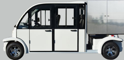
AK48-4-EB(-D): Enclosed Box