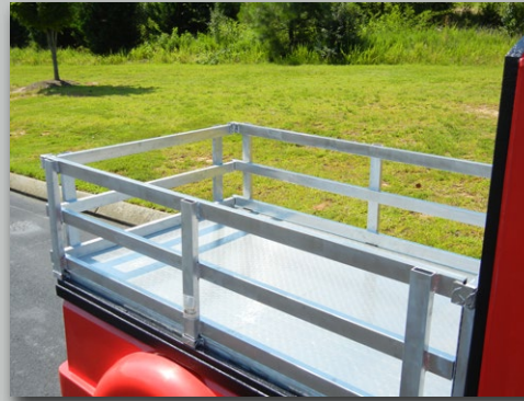
Stake back with removeable sides