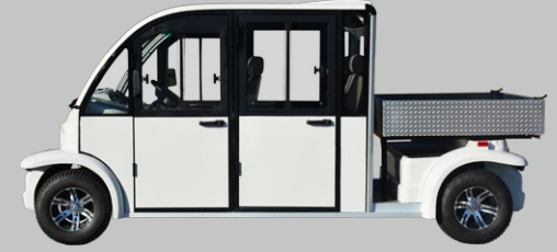
AK48-4-UB(-D): Utility Box