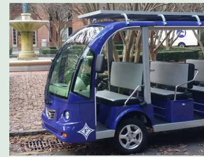
Roof-mounted solar panels (custom color shown)