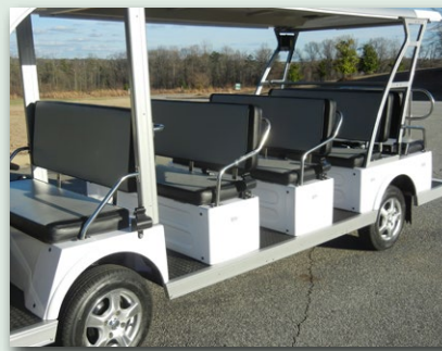
Spacious seating with seatbelts for protection (14-passenger model)