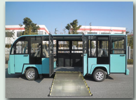
Aluminum wheelchair ramp unfolded