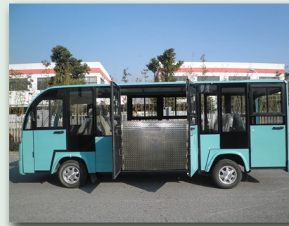
Ramp folds up flat for maximum use of space