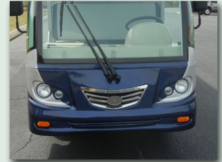
Stylish STAR EV exclusive front design with chrome finish grill (custom color shown)