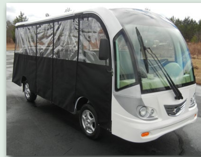
Sunbrella vinyl enclosure