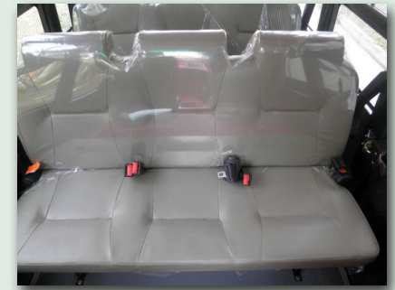
2-point seat belts for all passengers