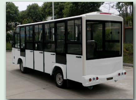
Aluminum and glass doors with solid-seal weather stripping