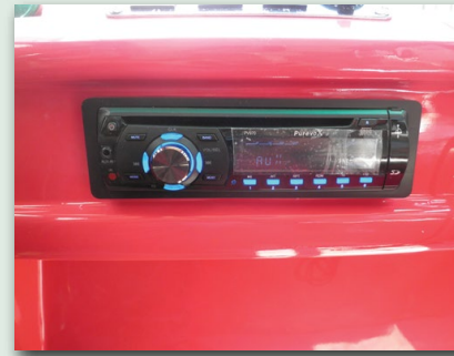
Stereo system with CD player and PA system