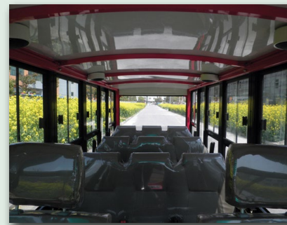
Spacious seating areas with excellent outside visibility