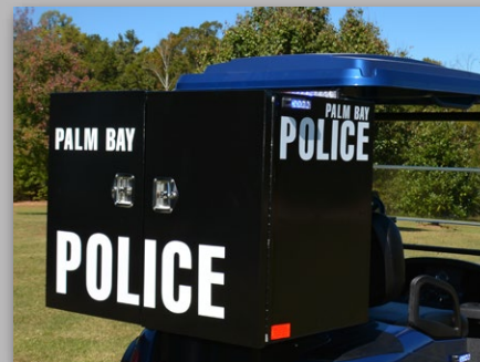
Custom locking aluminum box made to your specification