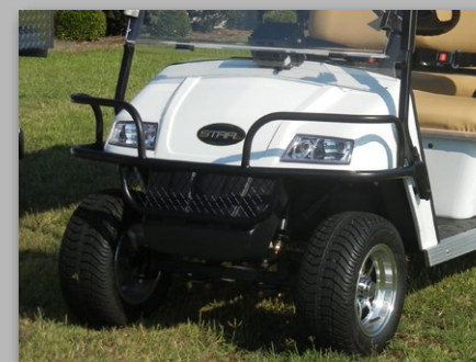
Optional brush guard for added protection