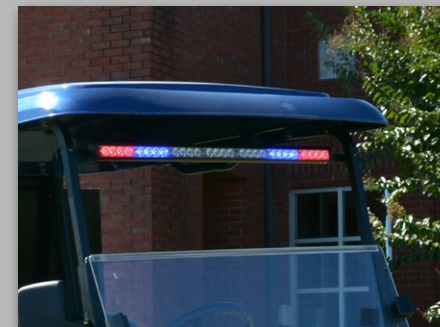
LED Light bar