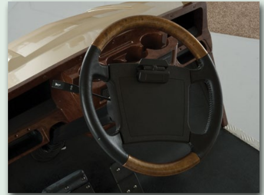
Optional wood grain package: wood grain dash, steering wheel and seat backs