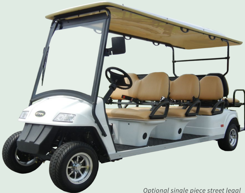
Optional single piece street legal windshield and wiper shown.

The Star Classic is loaded with class-leading features like 10" aluminum wheels, lights, turn signals, and functional front and rear bumpers. Better yet, upgrades and options make the Classic endlessly customizable.