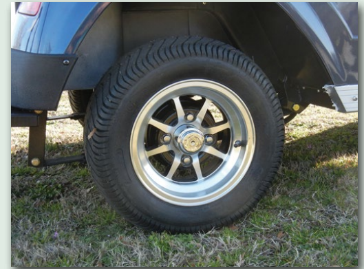
Standard 10" aluminum rims