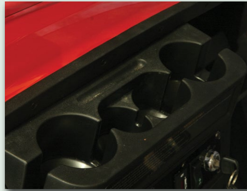
Four front cup holders