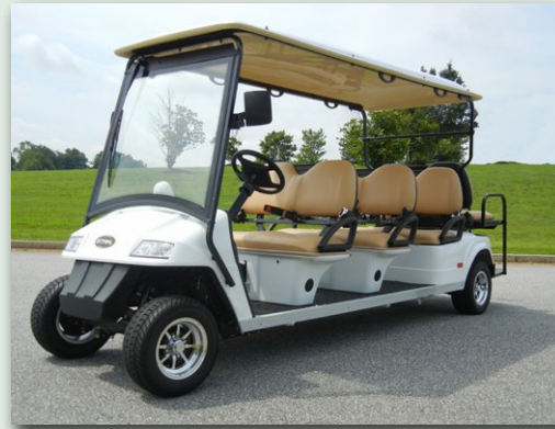
Solid front bumper, rack and pinion steering