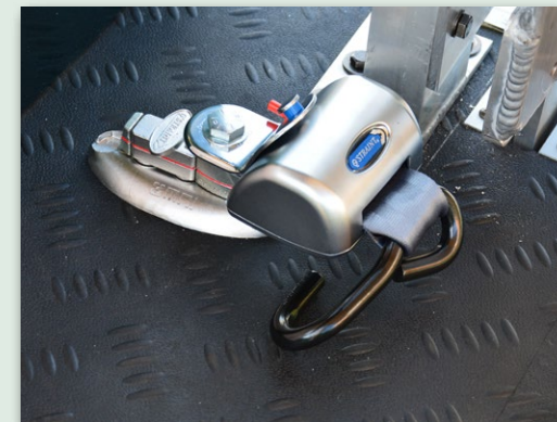
Removeable safety locks to secure wheelchair