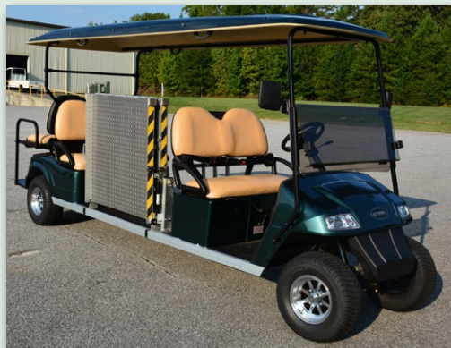
US-made aluminum bi-fold ramp