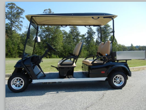
Also available as 2 or 4 passenger