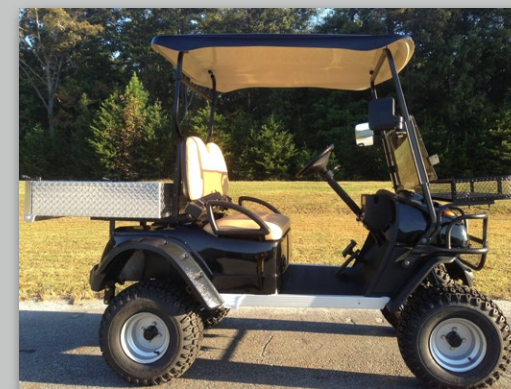
Also available as lifted model (STAR Sport)