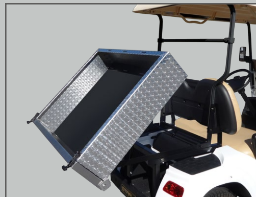
Upgrade: Tipping cargo box