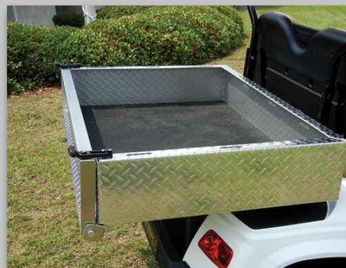
Heavy-duty recycled tire insert