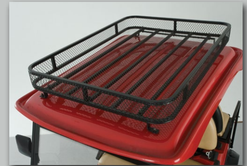
Optional roof rack