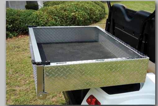
Heavy-duty recycled tire insert