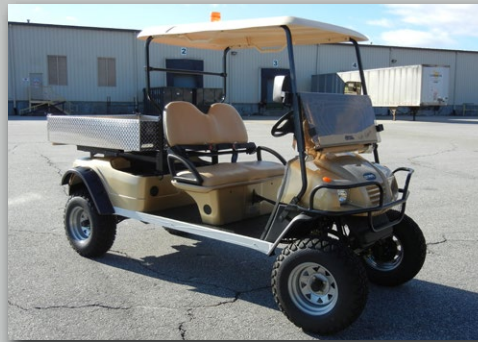
Also available in HCX style (STAR Sport 48-2-HCX)