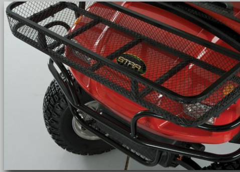
Heavy duty clay basket and brush guard