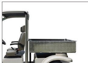
Utility Box (standard)