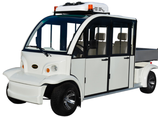
AK48-4 Shown with amber strobe light, air conditioner, and door upgrades.

Custom colors available: allow 12 weeks lead time.