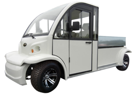
AK48-2-Long Shown with door upgrade.