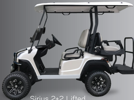
Sirius 2+2 Lifted